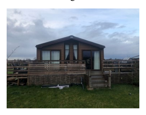
South facing elevation