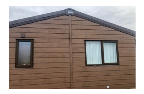
North facing elevation