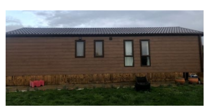
West facing elevation